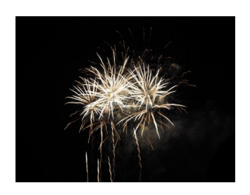
FIREWORKS 10:30 p.m. following Grandstand Concert