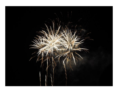
FIREWORKS 10:30 p.m. following Grandstand Concert